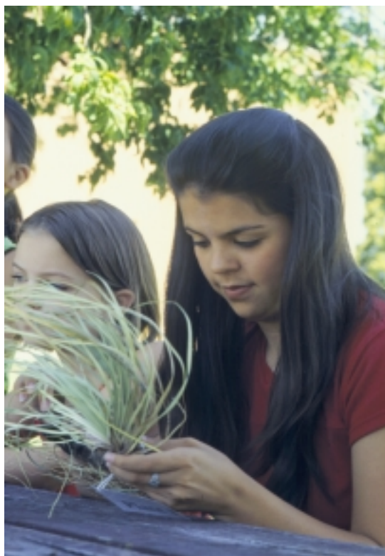
Figure 3. High school student examines “buried treasure” of beargrass ( Xerophyllum tenax ).

Requirements for funding and time are the main limitations of the FireWorks program.