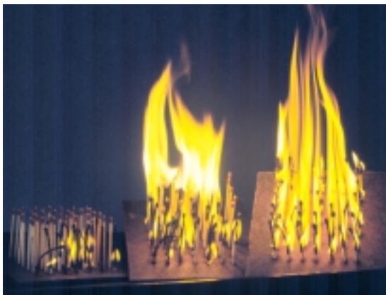
Figure 1. Experiment illustrates effect of slope on fire spread.

it is a species-specific characteristic allowing variable protection of phloem and cambium from lethal heating. In FireWorks , students learn about underground plant parts (“buried treasures”) by first observing aboveground parts such as flowers and leaves from specimens, then hypothesizing (“imagining”) and drawing the underground parts that they think those plants might have. This work encourages them to consider the difficulty of