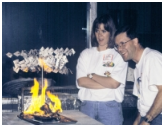
Figure 2. Teachers at workshop use a model tree to investigate effect of tree and forest structure on fire spread.

Students use reference materials in the trunk to learn about several organisms in each forest type. Then they collaborate to depict the flow of energy from the sun throughout the resource web, and to dramatize secondary succession in different kinds of forest with and without fire.